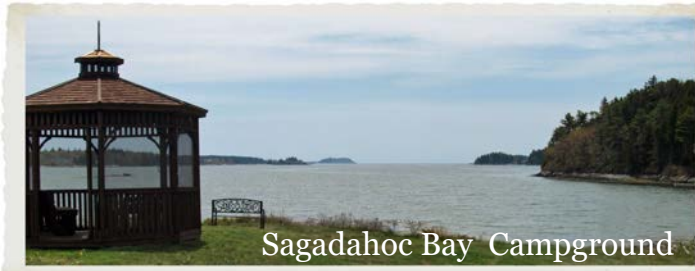
Sagadahoc Bay Campground