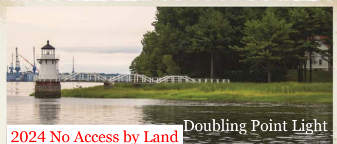
2024 No Access by Land