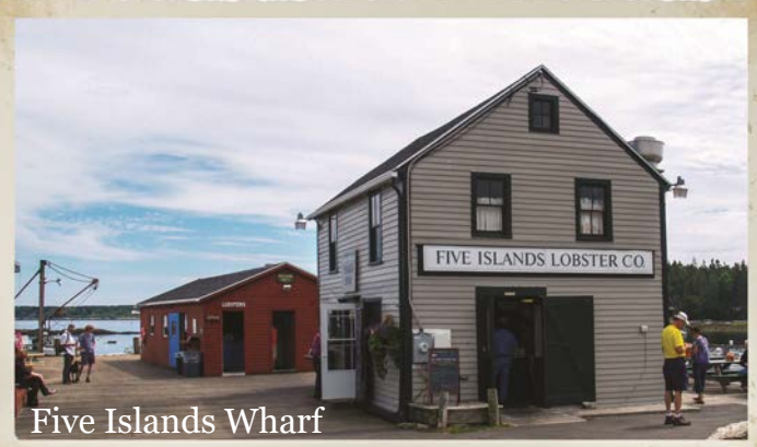
Five Islands Wharf